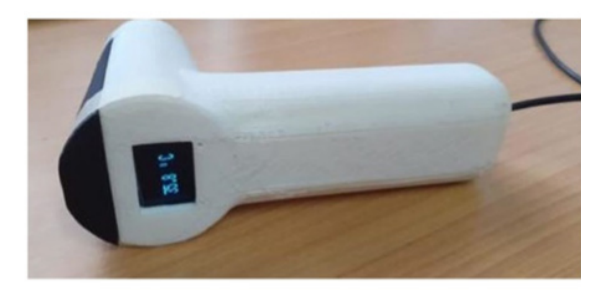
Digital Infrared Thermometer

CSIR's constituent Lab, CSIR-NCL Pune, has been leading the way in promoting innovation and entrepreneurship through its Venture Centre for the past decade and innovations from there are helping in the fight against the Corona outbreak. Two of the recent innovations that can help