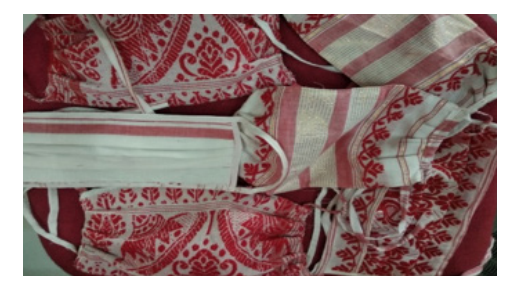
Homemade made masks from Gamocha

Rural women from the region were trained to produce homemade mask from traditional 'Gamocha' (a traditional Assamese cotton towel) by RWTP, Jorhat. Design of the homemade mask has been finalized, around 150 Gamochas purchased and two sewing machines arranged (6 homemade masks can be prepared from one Gamocha).